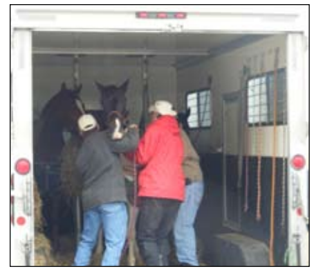
Horses being evacuated from a disaster area.

One of the greatest costs of not being prepared is that owners may never find their animals again after a disaster. In addition, lack of preparedness puts undue strain on a rescue team, as they are faced with unmarked, untamed, and potentially unwanted horses. As a horse owner, you have the primary responsibility to plan ahead for how you will care for your horses and not rely on rescue organizations.